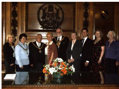
Meeting of Civic Dignitaries 6 th June 2011